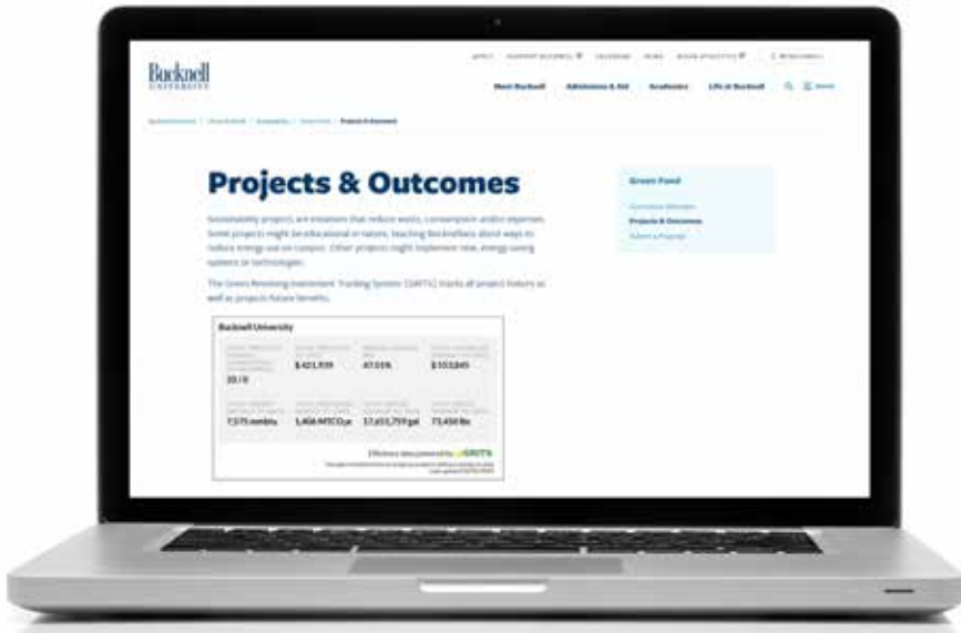
FIGURE 2: The GRITS Public Dashboard, as set up by Bucknell University