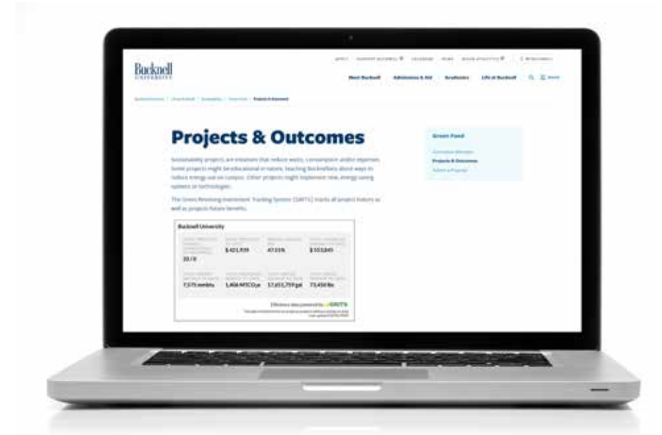
FIGURE 2: The GRITS Public Dashboard, as set up by Bucknell University